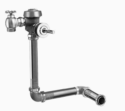
Variation Not Shown: 1" Straight Control Stop